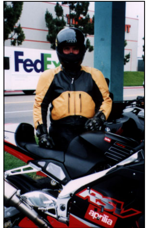
Well, it is a BMW suit, shipped especially from Europe. But the Aprilia from Oceanside has been taking its owner to a bunch of track time.